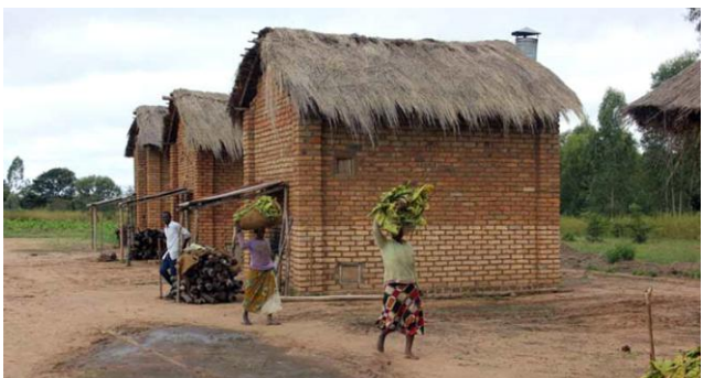
Figure 3: Farmers taking tobacco to barns for curing

Which the 2018 - 19 tobacco selling season in progress it is imperative to ask whether growing tobacco has been worth it in monetary and environmental terms or not for most farmers. In a visit to rural Chihota (land of my ancestors) one cannot fail to notice the massive deforestation that has affected the area as a result of tobacco farming. Popularly known as the golden leaf in Zimbabwe most farmers have resorted to growing tobacco instead of the traditional crops that is maize and ground nuts. Growth in the number of tobacco farmers has been immense since the country's land reform programme.