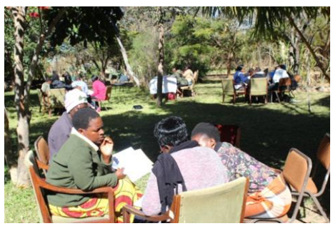
Figure 10: Participants at the Economic Literacy Seminar discussing social and economic rights in groups

The seminars are part of the coalitions' overall objective of strengthening transparency and accountability in public resource management through empowering