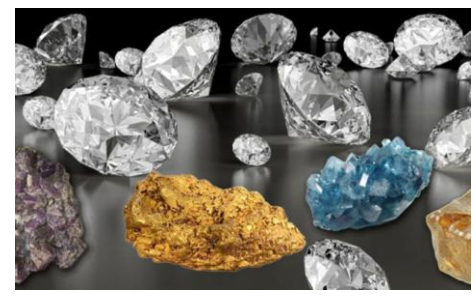
Figure 4: Some of the precious minerals extracted in Zimbabwe

t is critical to disaggregate and deconstruct governance into its operational constituents especially in the extractive sector.