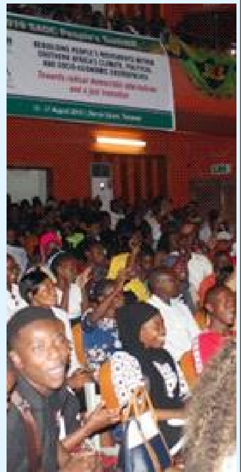
Pictures: Participants at the 2019 SADC People's Summit

Y ear 2019 saw ZIMCODD becoming host of the permanent Secretariat for the Southern Africa People's Solidarity Network (SAPSIN). SAPSN is a regional network of economic, environmental, social and political movements advocating for equity and justice in Southern Africa.