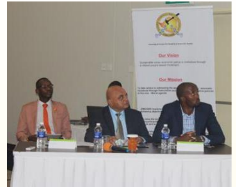
Picture: Hon Raj Modi (centre) following proceedings at PFM Reform Indaba in Bulawayo