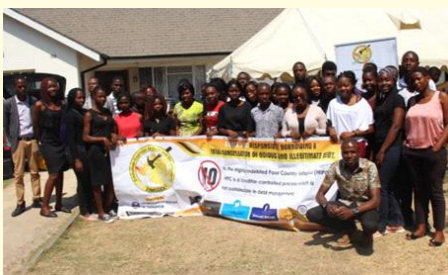
Picture: Youth pose for a group photo at a Youth Hub held in Harare

Youth initiative projects were meant to encourage the youth to continue with their social accountability role as citizens rather than disassociating themselves from economic governance issues both at local and national level. Natural resources governance, tax justice, trade and investment and the devastating debt crisis formed the basis upon which engagements with youth were formed.