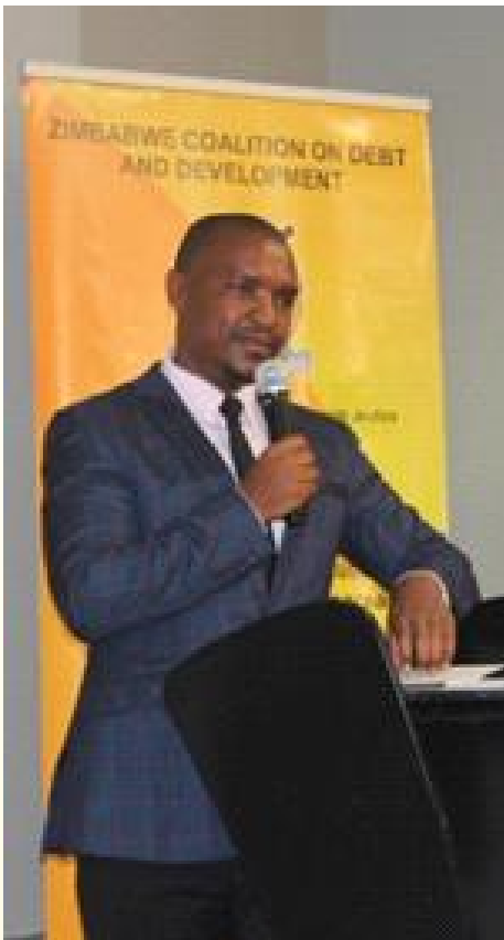
Picture: Hon Felix Tapiwa Mhona speaking on the role of Parliament in PFM at an Indaba in Harare

It is ZIMCODD's belief that effective public finance management can translate to progressive realisation of citizens' social and economic rights and that we can play a big role in demanding for this. However, we struggle to break through the government's firewall of secrecy and lack of transparency, particularly as relating to public debt. Furthermore, citizens' voices are increasingly silenced by the shrinking civic and political space and government intensifying its heavy-handed approach to dealing with non-state actors exercising their constitutional rights.