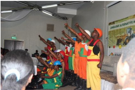
Picture: Iyasa group entertains participants at ZAMI