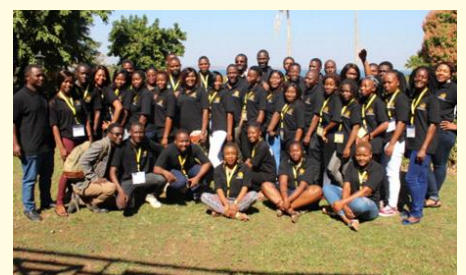
Picture: Youth at the Social & Economic Justice Academy in Kariba