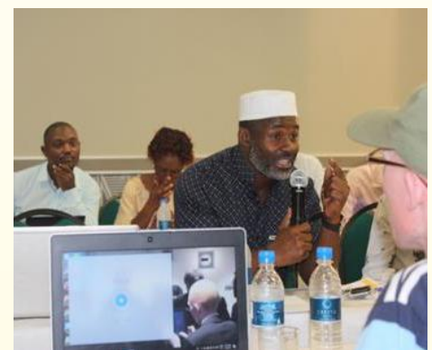
Picture: Hon Temba Mliswa speaks on corruption at a Harare PFM Indaba in Harare