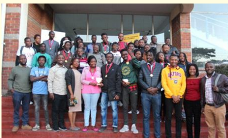
Picture: Youth debaters at the National Tertiary Institutions Debate Tournament