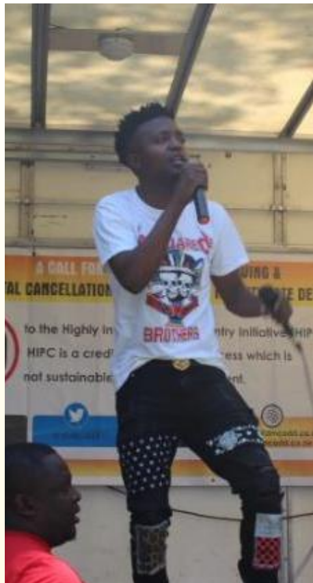
Picture: Killer T performing at the Economic Consciousness for Development campaign (edutainment)