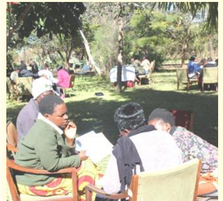
Pictures: Participants at the Economic Literacy Seminar and Social Networks Training

Zimbabwe is currently grappling with high levels of macro-economic challenges ranging from low industrial capacity utilisation, high unemployment rate, current account deficits, huge public debt and high inflation rate. All these ills are largely attributed to poor economic governance exacerbated by rampant institutionalised corruption.