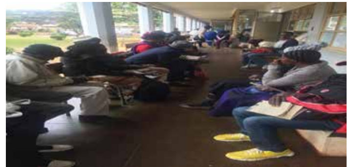
Long queues at one of Zim public health institutions: Image by Charles Kautare

The government is challenged to leverage on the vast mineral resources the country has to ensure accountability and channel the proceeds towards public health delivery.