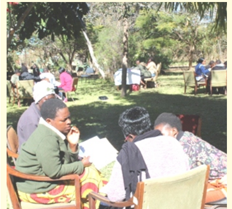
Pictures: Participants at the Economic Literacy Seminar and Social Networks Training

Zimbabwe is currently grappling with high levels of macro-economic challenges ranging from low industrial capacity utilisation, high unemployment rate, current account deficits, huge public debt and high inflation rate. All these ills are largely attributed to poor economic governance exacerbated by rampant institutionalised corruption.