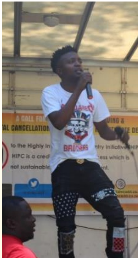
Picture: Killer T performing at the Economic Consciousness for Development campaign (edutainment)