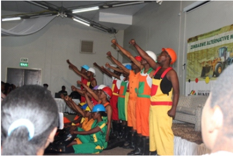
Picture: Iyasa group entertains participants at ZAMI