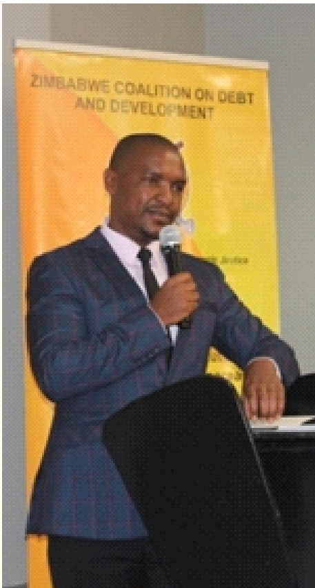
Picture: Hon Felix Tapiwa Mhona speaking on the role of Parliament in PFM at an Indaba in Harare

It is ZIMCODD's belief that effective public finance management can translate to progressive realisation of citizens' social and economic rights and that we can play a big role in demanding for this. However, we struggle to break through the government's firewall of secrecy and lack of transparency, particularly as relating to public debt. Furthermore, citizens' voices are increasingly silenced by the shrinking civic and political space and government intensifying its heavy-handed approach to dealing with non-state actors exercising their constitutional rights.