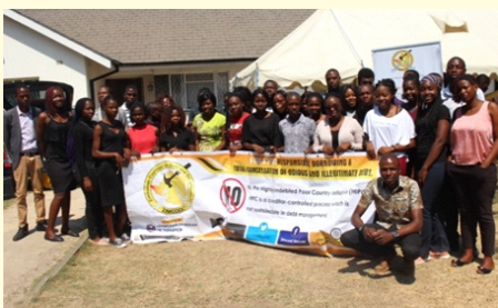
Picture: Youth pose for a group photo at a Youth Hub held in Harare

Youth initiative projects were meant to encourage the youth to continue with their social accountability role as citizens rather than disassociating themselves from economic governance issues both at local and national level. Natural resources governance, tax justice, trade and investment and the devastating debt crisis formed the basis upon which engagements with youth were formed.