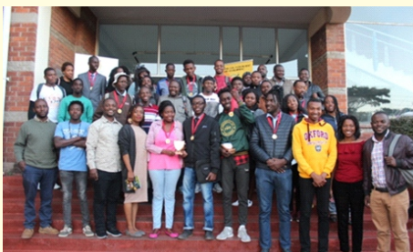
Picture: Youth debaters at the National Tertiary Institutions Debate Tournament