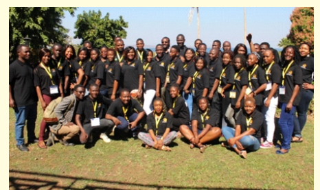
Picture: Youth at the Social & Economic Justice Academy in Kariba