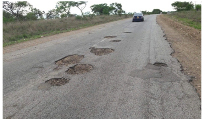
Pictures: Some of the socioeconomic woes that rocked Zimbabwe during the course of 2019