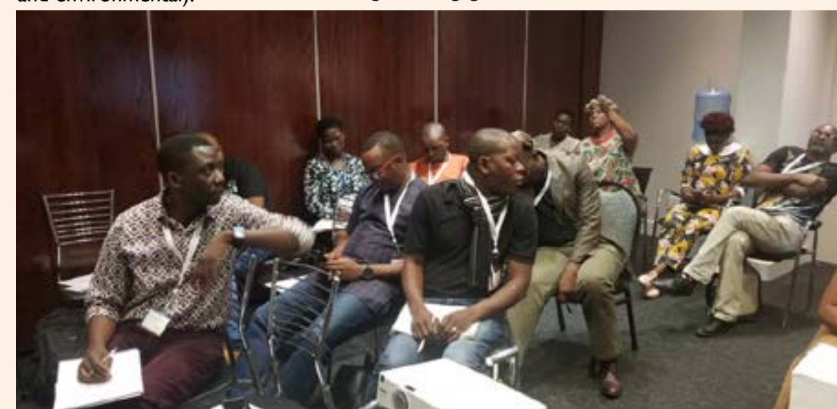
Participants at the 2020 Alternative Mining Indaba (AMI) which ran under the theme "Environmentally and Economically Sustainable Mineral Economies In An Era of Climate Change Catastrophe"

The participants to the event called on governments to deliberately design fiscal policies, social transfer programs and other models for redistribution of wealth from the extractive industry in order to manage expectations, bridge extractive driven inequalities and eradicate poverty, and deprivation in mineral rich countries. A further call to action was made for community benefit sharing schemes in the extractive sector to be multifaceted and strengthened through mineral revenue sharing and relevant social infrastructure to boost rural economic activities and promote employment and entrepreneurship.