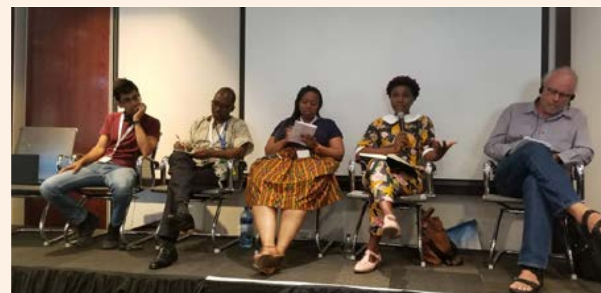
Panelists for the discussion on Extractive Industries and Fighting Inequality in Africa at the 2020 Alternative Mining Indaba (AMI)