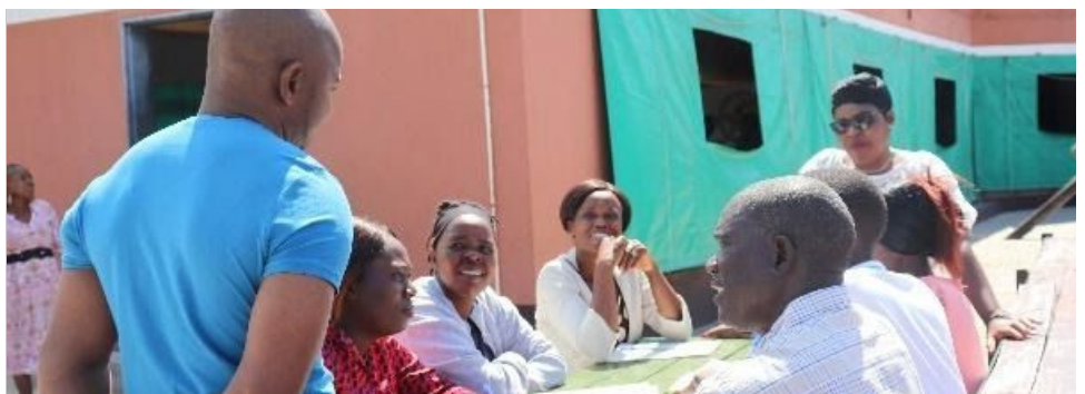
2 Participants at Chivhu Capacity Building Workshop for RAs and SEJAs