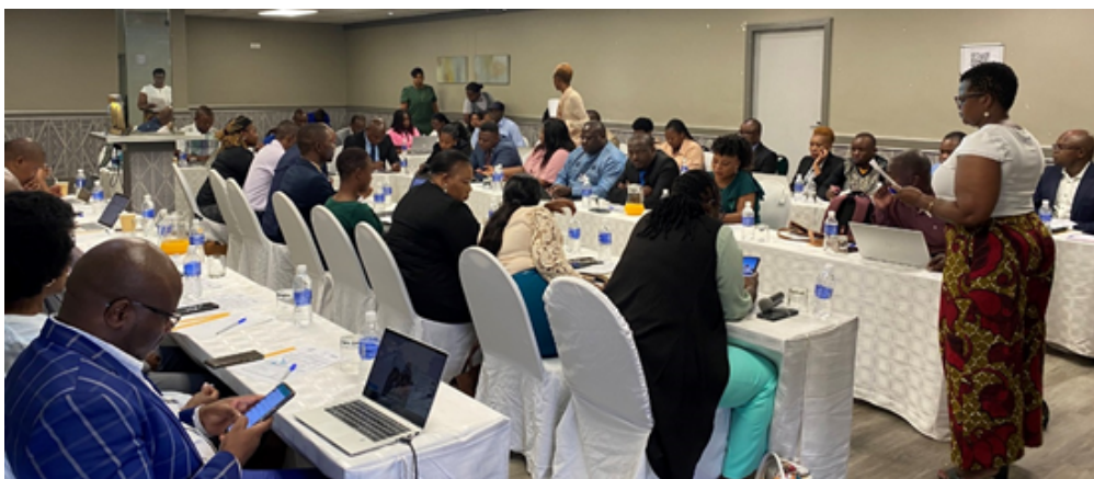
The Parliament Budget Office, Civil Society members and Parliament Health Portfolio Committee members listen to deliberations.

Positive changes have been noted following ZIMCODD capacity strengthening efforts of oversight institutions on public expenditure tracking and budget monitoring towards improving resource allocative efficiency and outcomes of public service delivery. The changes include the execution of Action Plans that were developed from these capacity-building engagements. ZIMCODD is still committed to monitoring and aiding with public finance management technical capacity until these Action Plans are fully implemented.