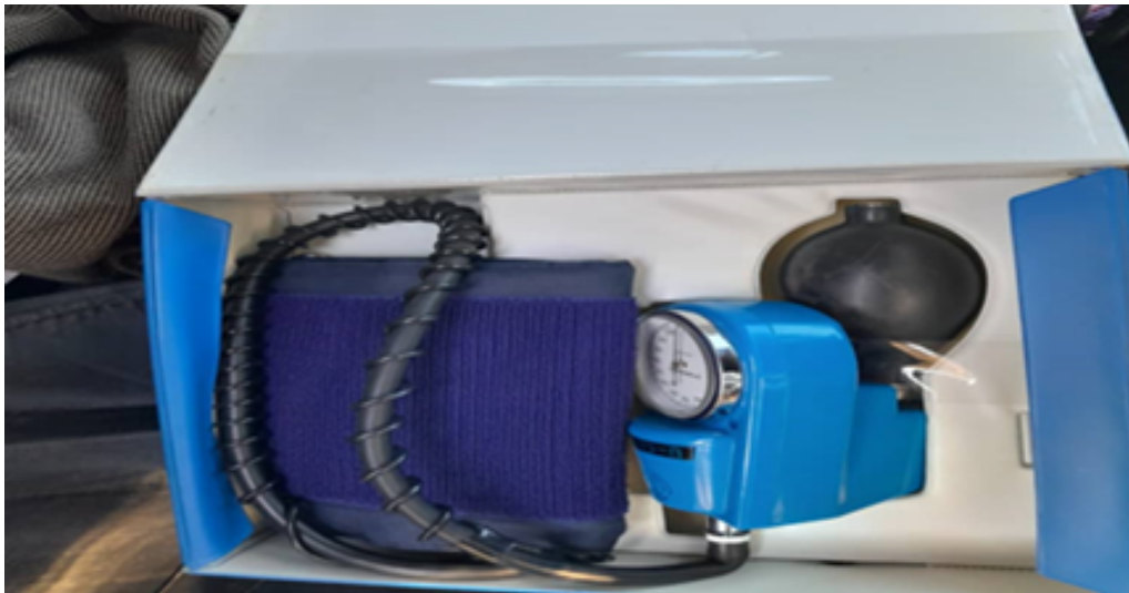
The donated blood pressure machine being used at Chinyika Clinic in Goromonzi