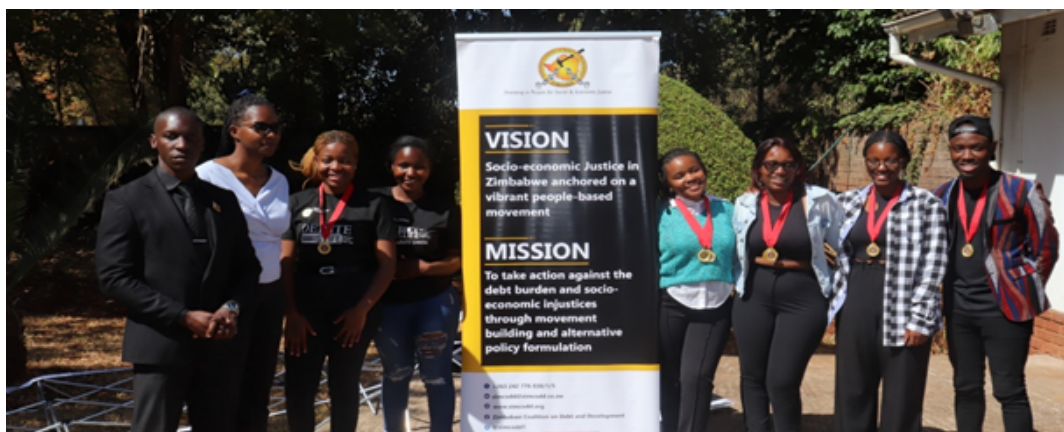
The best speakers & winning team post for a picture after the Harare Tertiary Institutions Debates

https://zimcodd.org/sdm_downloads/the-weekend-reader-4-august-2023/