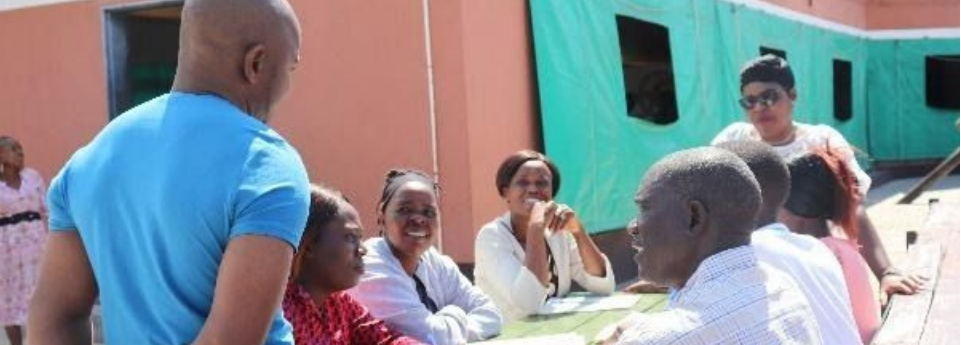
2 Participants at Chivhu Capacity Building Workshop for RAs and SEJAs