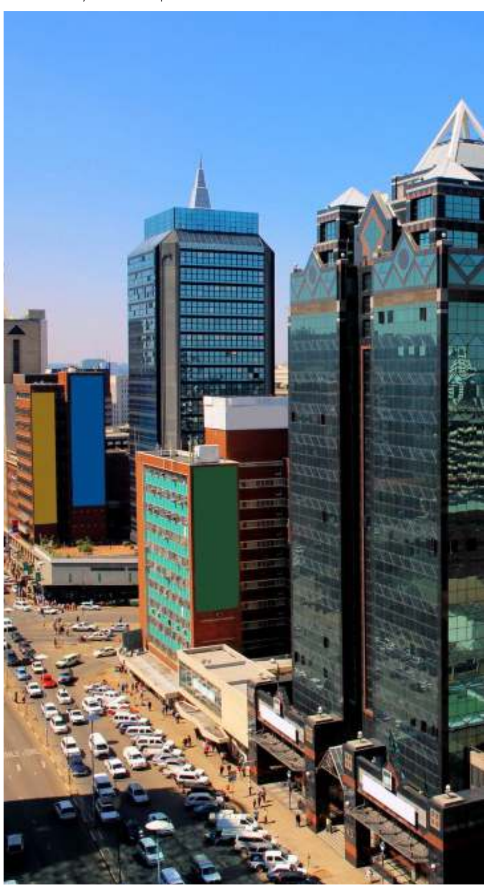
Kawewe, Saliwe M. and Dibie, Robert (2000) "The Impact of Economic Structural Adjustment Programs [ESAPs] on Women and Children: Implications for Social Welfare in ZIMBABWE, "The Journal of Sociology & Social Welfare: Vol. 27: Iss. 4, Article 6. Available at: https://scholarworks.wmich.edu/jssw/vol27/iss4/6

The 2% tax introduced in 2018 and the privatization of state enterprises pushes elite accumulation of wealth further exacerbating unequal distribution of wealth and income. This explains the regressive nature of the Zimbabwean tax system where the poor contribute more in tax revenue than the rich.