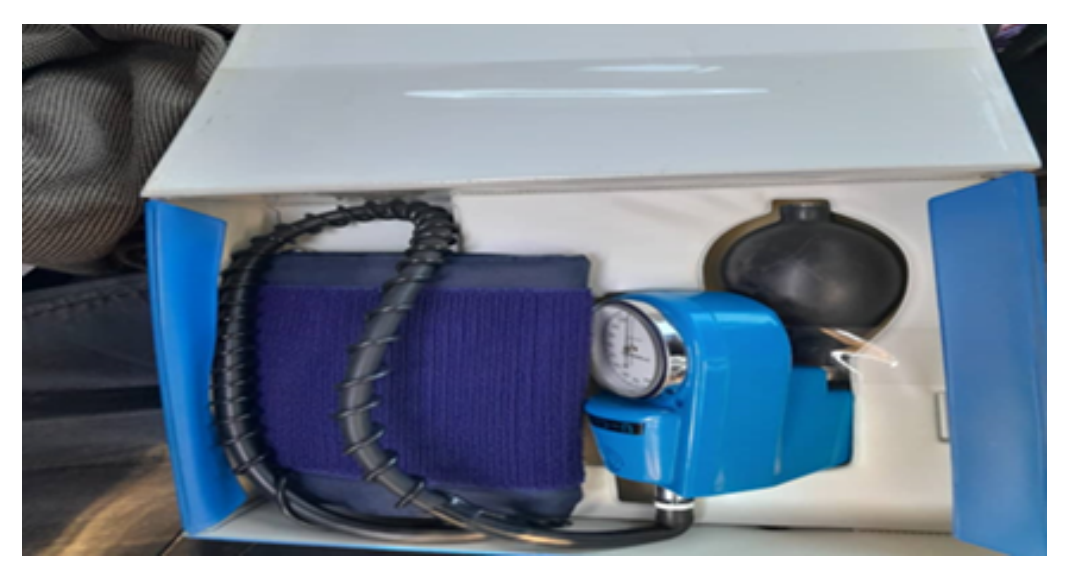
The donated blood pressure machine being used at Chinyika Clinic in Goromonzi