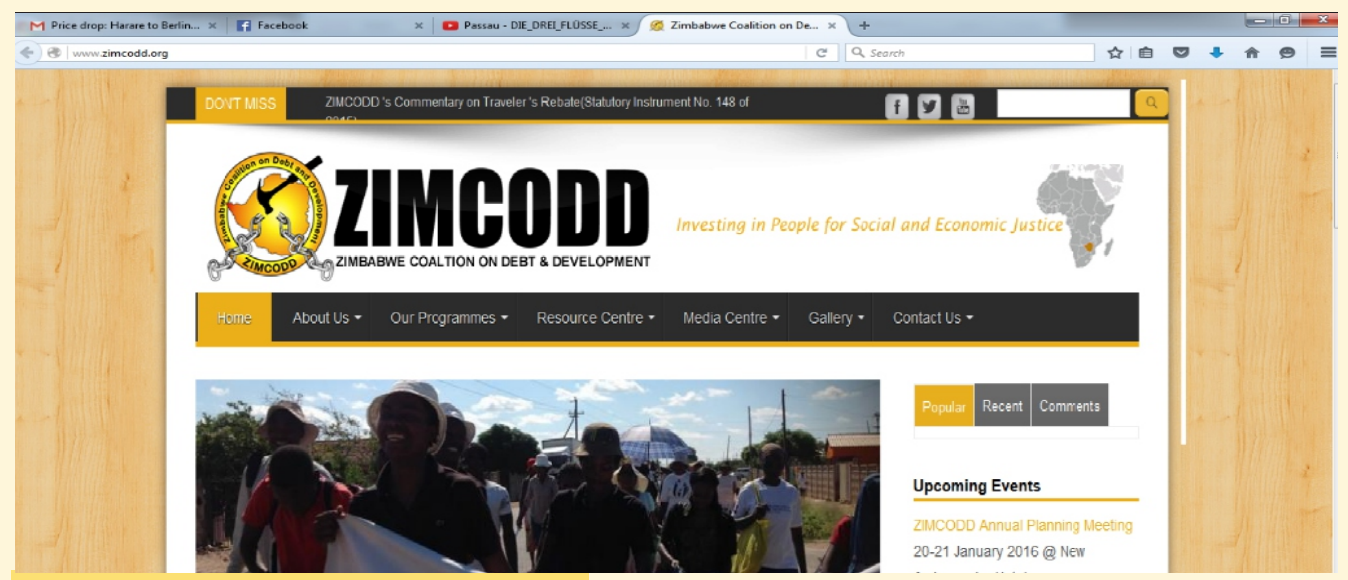
A screenshot of the new ZIMCODD website: www.zimcodd.org

The website is linked to the organisation's social media platform, which allows visitors to access all information at once and encourages participation in online platforms discussions. Updating of the website is on-going.