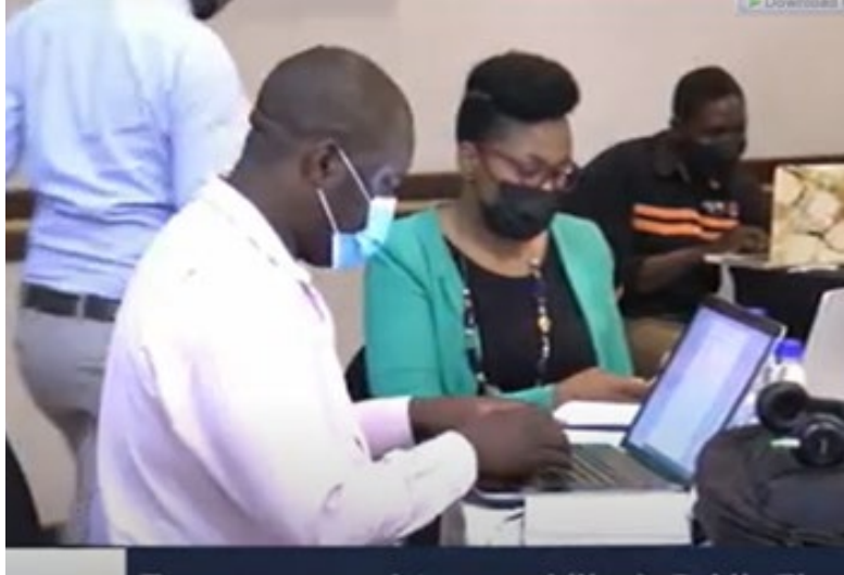
Transparency and Accountability in Public Fina