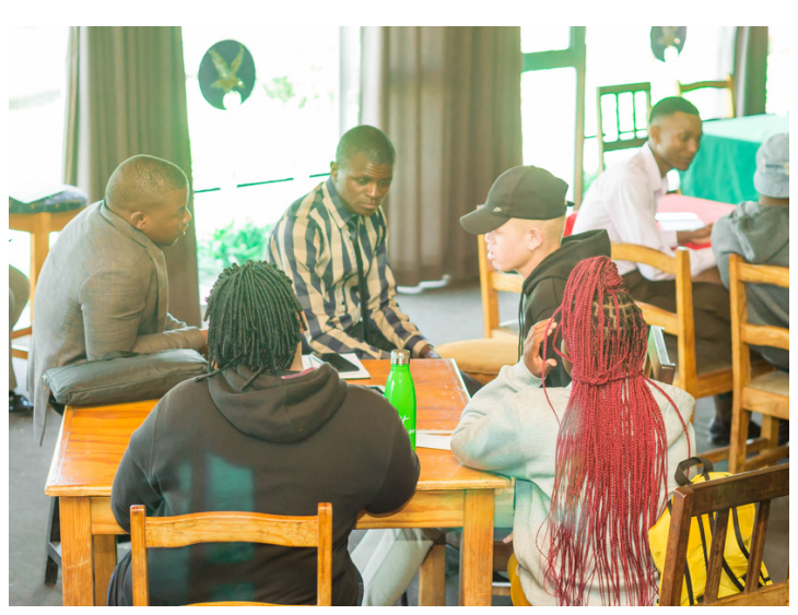
The Mutare Teacher's College team discusses their strategy

The second and final round of the competition was on the need to finance climate change mitigation measures through the system of climate reparations. According to expert environmentalists, every person could wake up dead in 2050 if the climate crisis is not averted. This makes climate change one of the most important conversations in the world right now, particularly in Sub-Saharan Africa which bears the brunt of harmful environmental practices by the Global West.