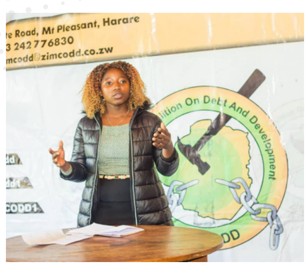
A debater asks, 'Should lithium be exported in its raw form?'

The Zimbabwe Coalition on Debt and Development (ZIMCODD) successfully convened the annual National Tertiary Institutions Debates from 1st August 2023. The debates are being held under the theme, "Towards a just energy transition in view of the discovery of lithium and other minerals". Debating teams that are participating include the National University of Science and Technology (NUST), Mutare Polytechnic College, Midlands State University, Africa University, Manicaland State University, Women's University, Mutare Teachers College, and Mary Mount Teachers College. The ZIMCODD debate project was initiated in 2012 and it has evolved into a fully-fledged SADC regional competition that starts at the national level. The debates include young people in shaping policy around the extractives sector while building a strong sense of social and economic justice amongst young people. The 2023 debates will also take a deliberate approach to discuss taxation as the main pivot that anchors Domestic Resource Mobilisation (DRM) in Africa and beyond. As the Southern African Development Community (SADC) People's Summit is fast approaching (16-18 August) and the debaters will join other SADC countries to call for a UN Tax Convention. The debates will contribute to shaping discourse on extractives, mobilizing tertiary students towards the 2023 SADC People's Summit debate and public speaking gala set to take place in Angola, Luanda.