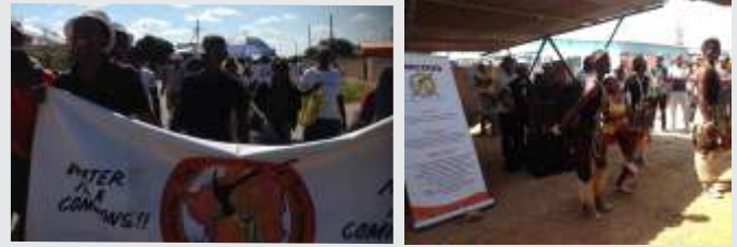
World Water Day Commemorations in Bulawayo

On the 22nd of March 2015 Zimbabweans joined the rest of the world to commemorate World Water Day under the theme 'Water and Sustainable Development'. The day came at a time when service delivery especially water provision in Zimbabwe is deteriorating to unprecedented rates with the majority of the urban dwellers facing acute water shortages. The World Water day has been observed since 22 March 1993 when the United Nations General Assembly declared the day as "World Day for Water". For the general public to show support, it is encouraged for them not to use their taps throughout the whole day. Continued on page 2 ➔