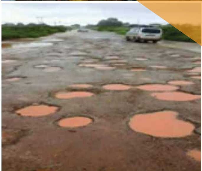
Examples of deplorable service delivery in Zimbabwe: Image Source; Internet