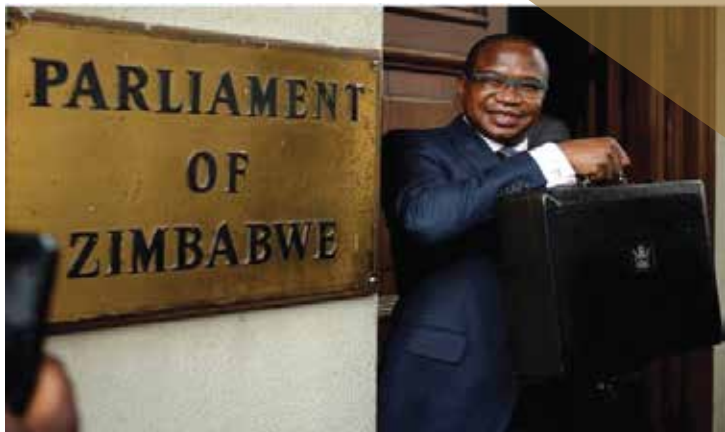
Minister of Finance Prof Mthuli Ncube

These are some of the highlights of the deliberations made during the Public Finance Management Reform Indabas convened by the Zimbabwe Coalition on Debt and Development (ZIMCODD) in Gweru and Mutare during the week ending 13 September 2019 with specific focus on citizen participation in national budget processes. The main objective of the interface was to interrogate the current national budgeting frameworks and proffer recommendations on how to enhance citizen participation.