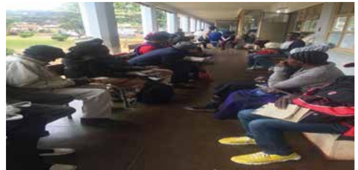
Long queues at one of Zim public health institutions: Image by Charles Kautare

The government is challenged to leverage on the vast mineral resources the country has to ensure accountability and channel the proceeds towards public health delivery.