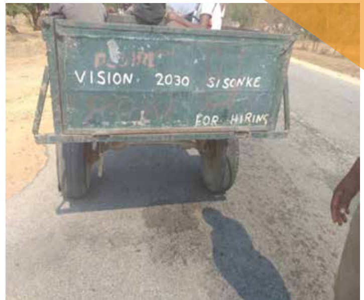
Scotch cart in Marange with inscription "Vision 2030 Sisonke".

These include dealing with systemic corruption, tightening screws on the public sector to ensure efficiency and to put in place measures that ensure the economic empowerment of Zimbabweans.