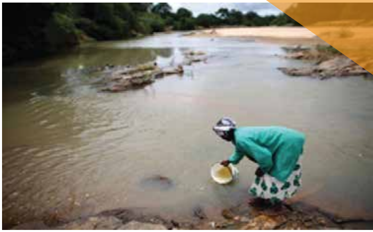
A woman fetching water from a river