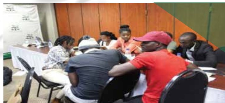
Participants at the Youth Symposium

There are those who strongly felt that since most of the rich people in Zimbabwe amassed wealth through socioeconomic injustices, taxing them heavily would help bring about restorative justice. There therefore was the need for an inclusive economic governance system that took young people on board. The need for a progressive system that ensures good tax policies are in place to guarantee the redistribution of the country's wealth between the rich and the poor is long overdue. The symposium concluded that the struggle for economic justice in Zimbabwe cannot be complete without concerted efforts from young people in their different capacities. Zimbabwe's tax system in its present state is characterised by injustices tilted in favour of the few who have both the financial and power muscle. The youth are a significant demographic in Zimbabwe and empowering them ensures that they play an active role in the national economic agenda.