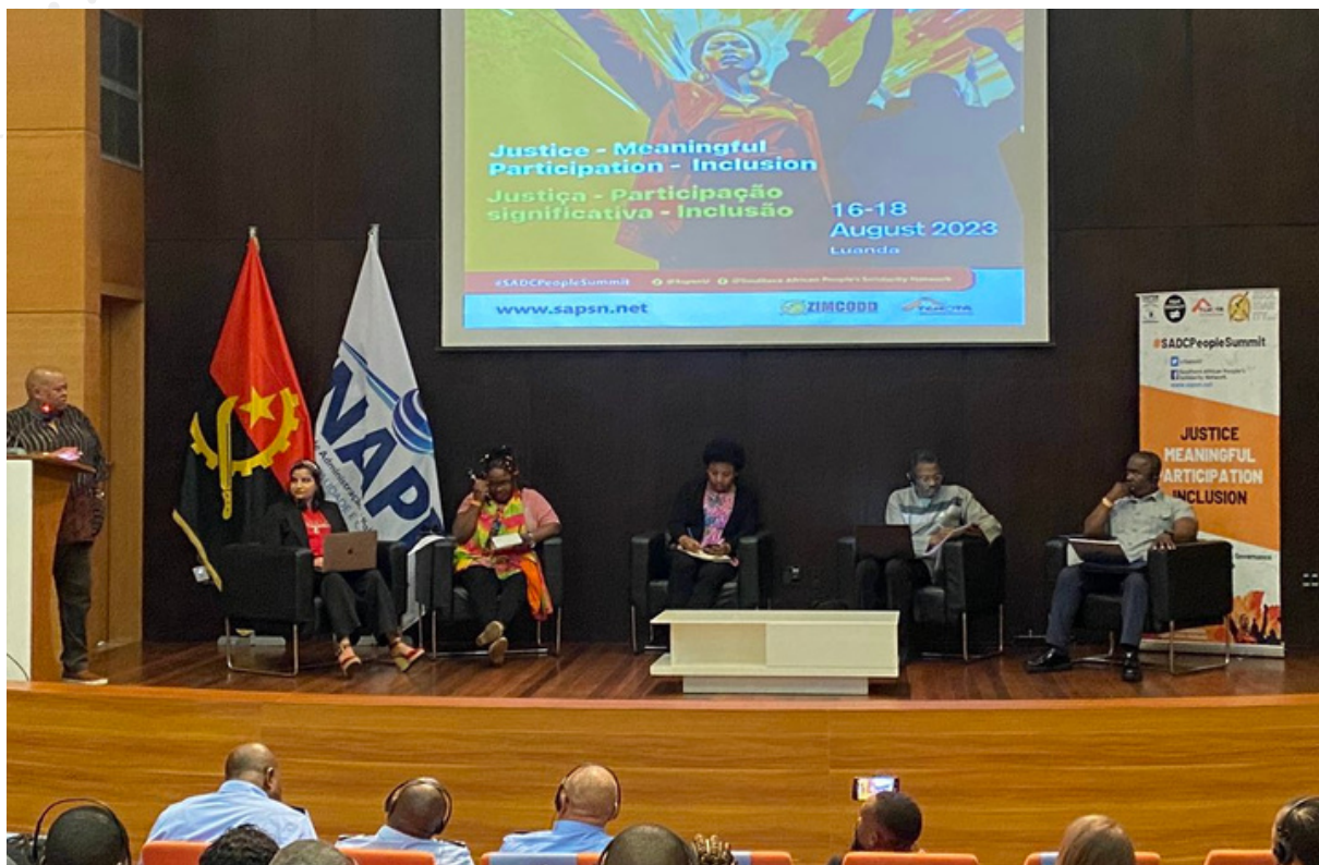
A panel at the People's Summit discusses migration, economic development & the importance of democracy to economic development.