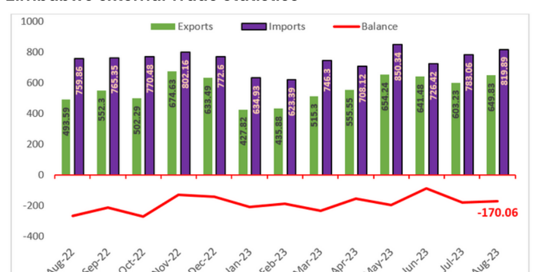
Zimbabwe external Trade Statistics

In August 2023, Zimbabwe exported merchandise worth US$649.83 million, up 7.7% from US$603.23 million realized in July 2023. At the same time, merchandise imports came in at US$819.89 million, up 4.7% from July outturn of US$783.06 million. This means that Zimbabwe incurred a trade deficit (imports exceeding exports) to the tune of -US$170.06 million, down from -US$179.83 million in July 2023. Cumulatively, the nation incurred a trade deficit totaling US$1.41 billion in the first eight (8) months of 2023. For the same period in 2022, the deficit was US$1.33 billion.