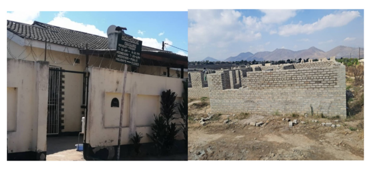
A. Current Hobhouse Clinic

The Polyclinic will also include a maternity ward, eliminating the need for expecting mothers to go to Victoria Chitepo, Sakubva Polyclinic, or St. Joseph hospitals for prenatal and postnatal services. Most of Mutare residents are hopeful that this will soon be a thing of the past because the Hobhouse Polyclinic is now on window level and will soon offer medical services and there will be no need for people to travel long distances for health services. Residents of Hobhouse have been affected by poor service delivery, unemployment, hopelessness, and a constant state of despair. The fact that most of the projects are being funded by ratepayers' money the move has increased openness and accountability in the use of public funds.