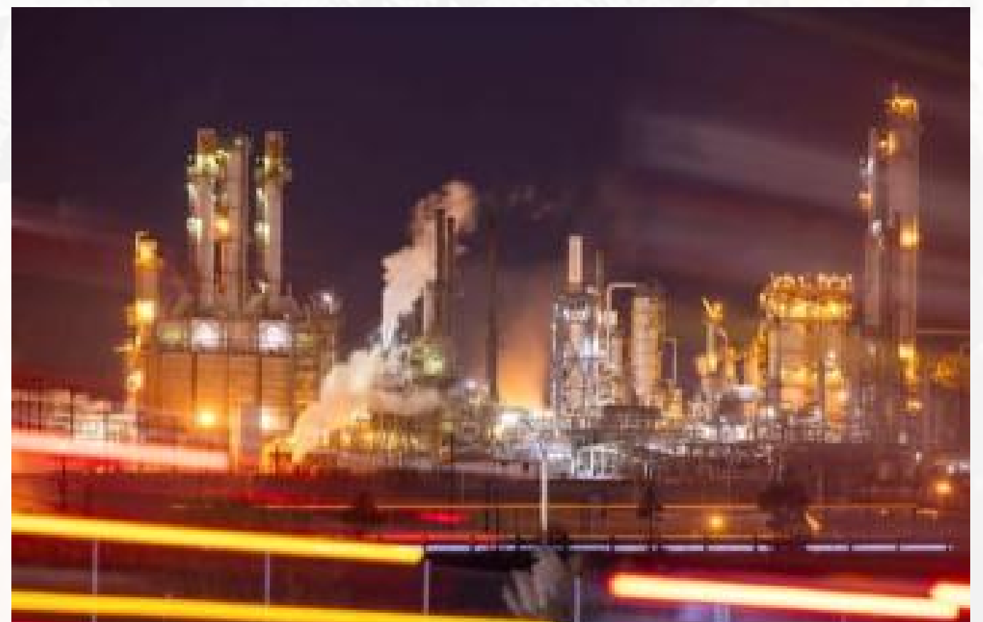
A picture of 1st world economies

Climate change refers to long-term shifts in temperature and weather patterns, largely caused by human activities. The biggest driver of this change has been industrialization particularly in developed countries such as the United States and parts of Europe. For decades, these nations have built their economies through heavy use of fossil fuels, large-scale industries, and high carbon emissions. While this development brought economic prosperity to them, it has come at a cost to the rest of the world.